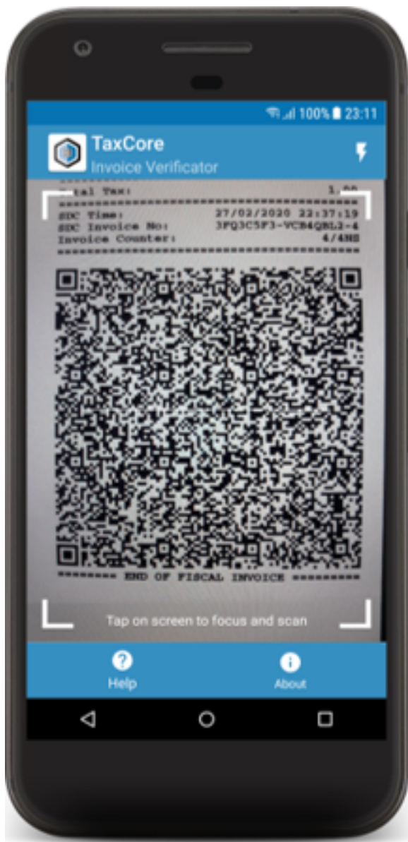
Customer Compliance Awards Program - Image of the QR code invoice scanning option

The Invoice Verification Service verifies invoice integrity and authenticity. When the service finishes with the verification, it displays the invoice status - either a "Valid Invoice" or an "Invalid Invoice" message.